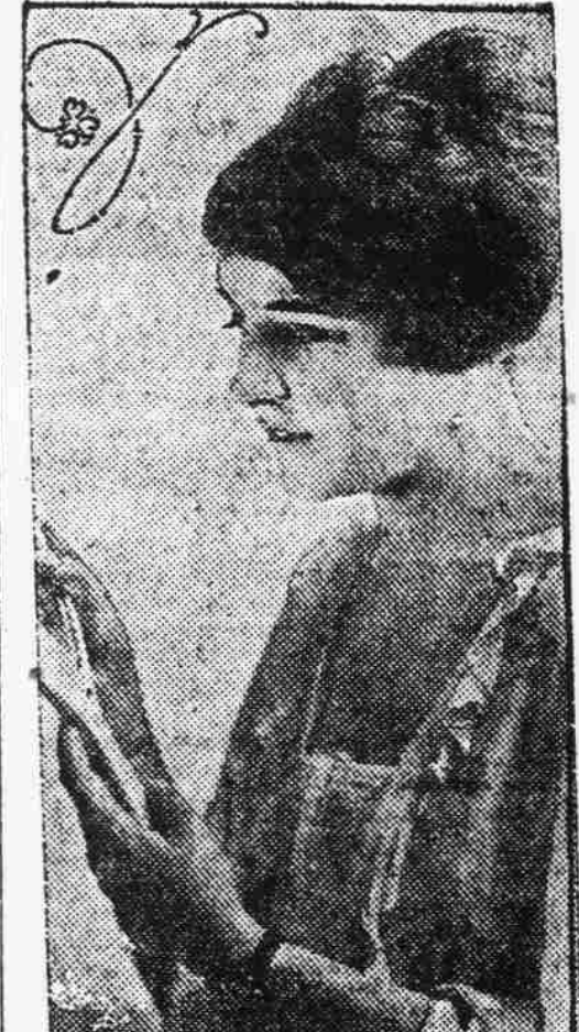
Here is something to make the eye-

mix yourself by melting the landline cocoa butter and wax and the moment they are melted adding the waimed This produces rather a thick cream which may have to be warned a trifle in very cold weather. But if you will your rub a little on the eyelids and around If you are going to begin this as a