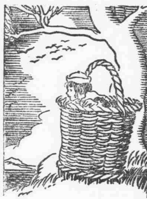
The King was let down in the magic basket near a tree.

Tinker Bob had always been careful not to surprise Major Pole Cat because it was Major's custom to accept no surprises without meeting them with a dose of poison acid. Major wouldn't do that for the world to the King of the Forest, but how could he know whether the King would be the next one to surprise him or not. There were so many creatures of the forest who loved to surprise everyone that he could never tell when the King would be next.