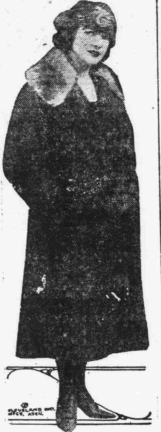
When the weather grows too severe for the suit or the topcoat a heavy fur-collared garment such as this one will be wanted.

When the girls adopt the knickers there will no longer be any excuse for the fool men to hang around the windy corners.