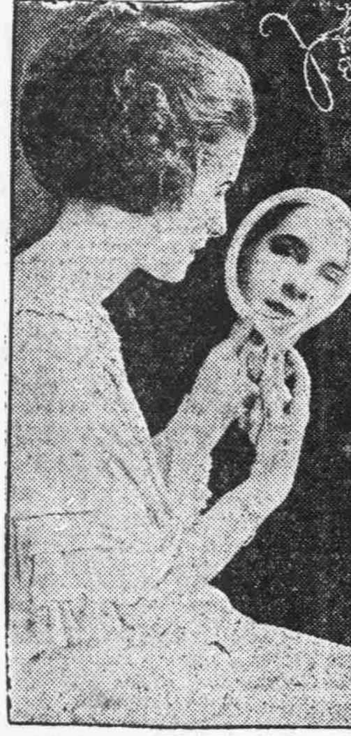
Will your hair look well this way?