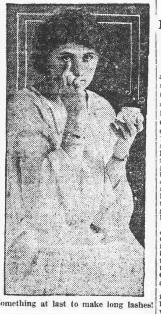
Something at last to make long lashes!

Vaseline has been frequently recommended, but as this is a mineral product it contains nothing that will actually nourish the roots of the hairs. Olive oil or castor oil, being vegetable products, have nourishing properties, therefore either of them can be considered a tonic. Castor oil also possesses the virtue of making the lashes a very little bit darker.