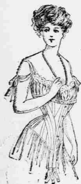
R.&G.Style A.7.Special New Model for Slender Figures. Price $1 00

Below we show 2 styles from the big line of R. & G. Corsets we carry.