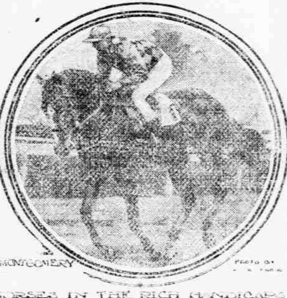
DANGEROUS HORSES IN THE RICH QUARTERS OF 1908