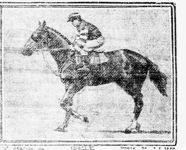
DANGEROUS HORSES IN THE RICH QUARTERS OF 1908

Suburban Day, Metropolitan Day, Brooklyn Day and Brighton Day are really society functions more than they are days of feverish desire to wager large sums of money.