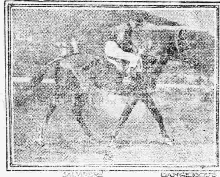
DANGEROUS HORSES IN THE RICH QUARTERS OF 1908