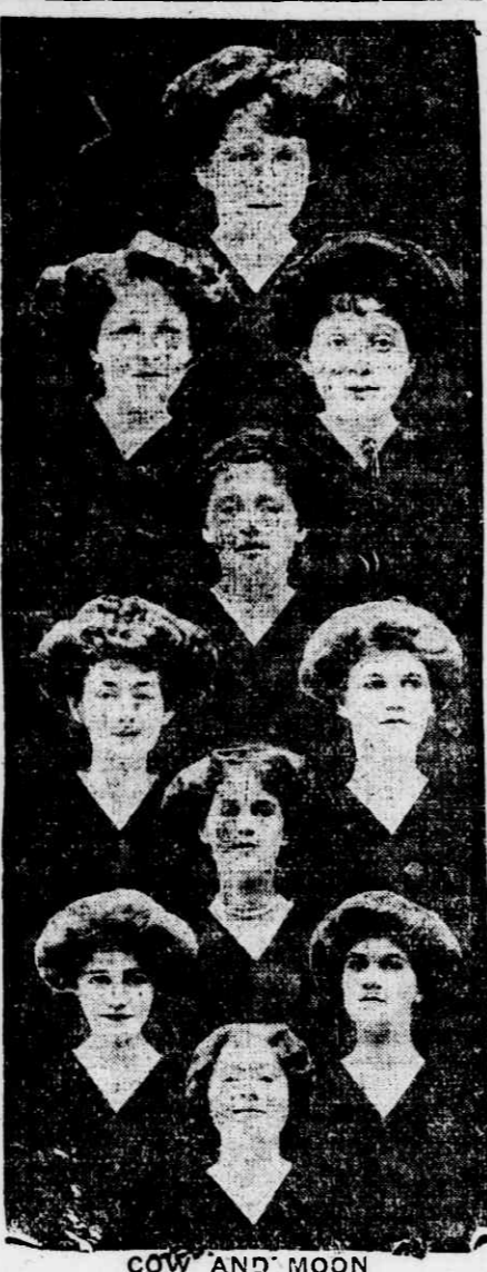
A bunch of girls appearing in "The Cow and the Moon" which plays here tomorrow, matinee and night.

Blanche Ring Tonight. Everybody seems to be cognizant of the fact that Blanche Ring and her Yankee Girls are coming to the Academy of Music tonight. The seat sale has been a hummer, and there is every reason to believe that a packed house will greet the charming comedienne and her company. There is said to be something rather satisfying about "The Yankee Girl" aside from its clever star, and that is the excellent character studies and the well drawn dramatic conception in the little Latin republic on the Isle of Britannia. At times it doesn't seem like comic opera so faithfully are they sketched and so well portrayed, and it makes the auditors take the piece more seriously, and proves that both lend a zest to the other. Blanche Ring's songs are so nicely interlarded and so well timed that they even balance of good entertainment is preserved throughout, and a very satisfying evening is offered to those who sit in front. Miss Ring will no doubt receive a royal welcome on her first appearance this evening. "The Cow and the Moon." "The Cow and the Moon," which Mr.