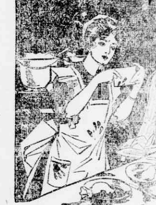
ome and disappointing.

Harmonizing and How to Treat or Dischary Colors fully explained in cur Free Booklet