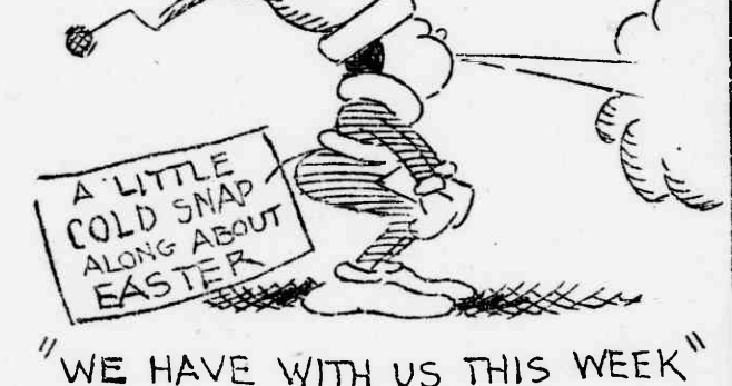
"WE HAVE WITH US THIS WEEK"