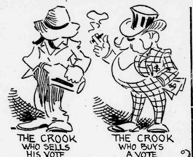
WHAT'S THE DIFFERENCE?