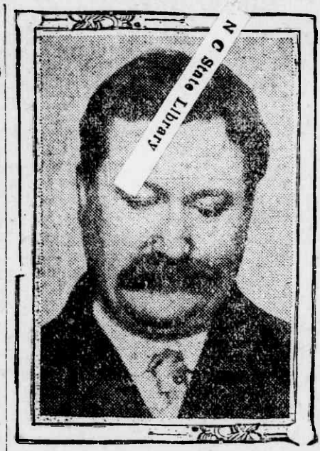
WILLIAM J. BURNS

Lima, Peru, July 26.—There is general and deep seated indignation over the recent attacks upon Peruvians at Tacna and Arica, Chile, which grew out of popular ill feeling resulting from the boundaries dispute. The papers published the Chilean consultants explanation of the incidents and the Peruvian authorities have taken active measures to prevent retaliation here.