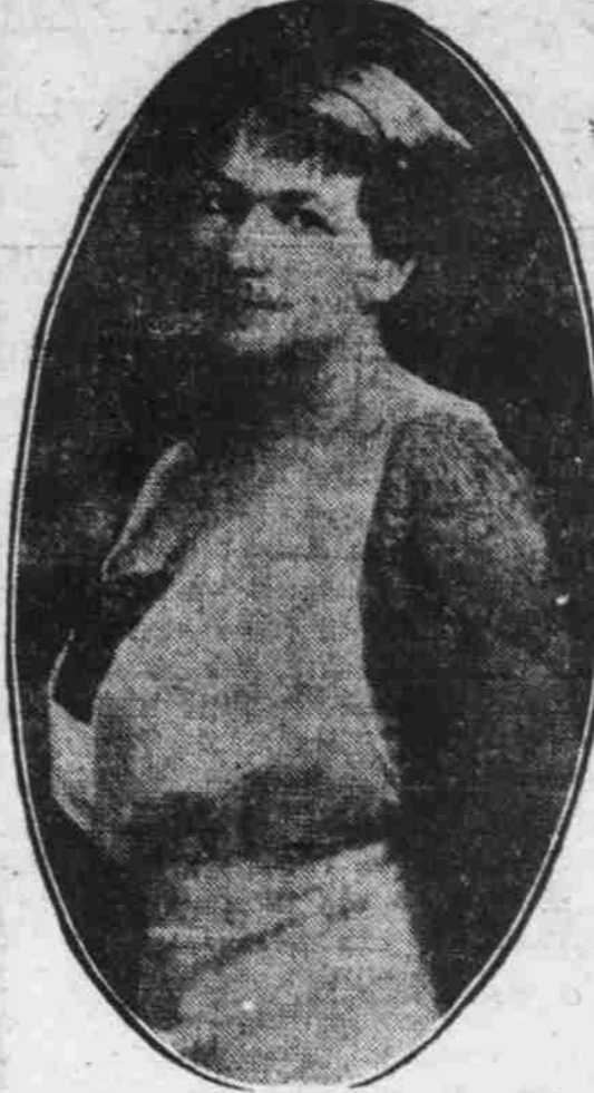
Blanche Bates in "Nobody's Widow."