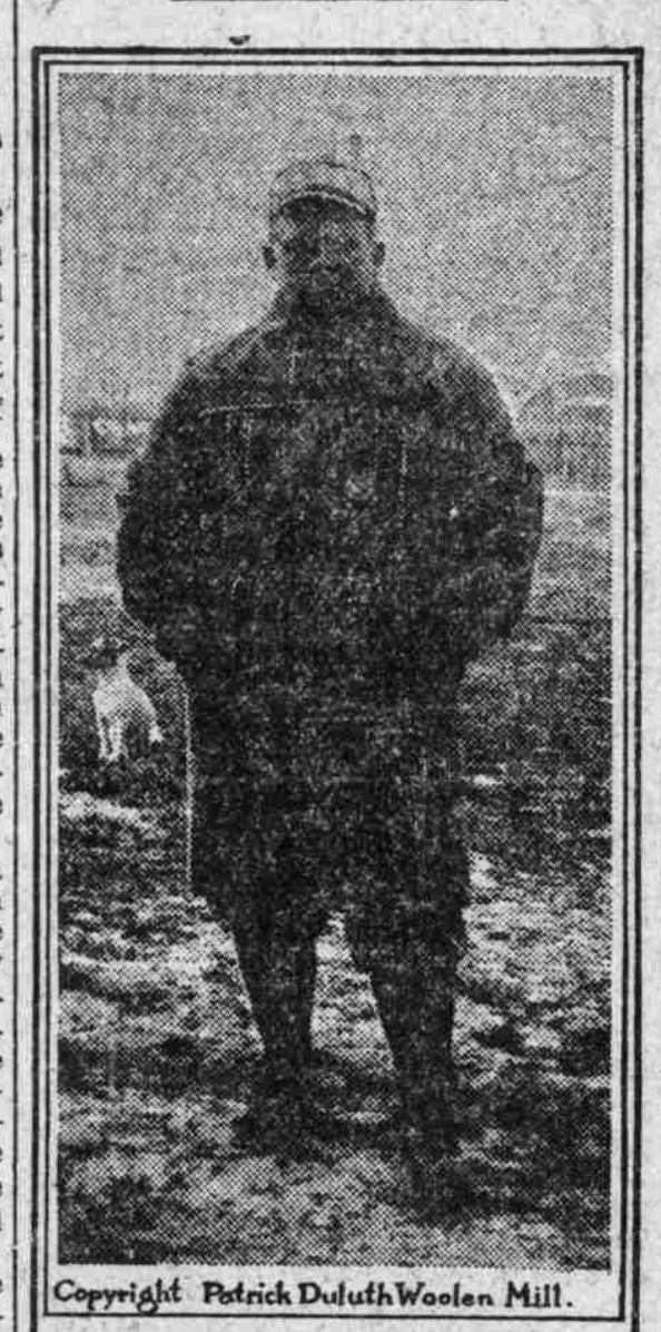
J.J. MCGRAW-Manager N.Y. Giants wears a genuine Patrick Mackinaw

MANAGER M'GRAW. The Little Napoleon of baseball has again gathered together a strong team and after losing the first two or three engagements has pulled his team up in first place. It wouldn't seem natural for McGraw not to be there.