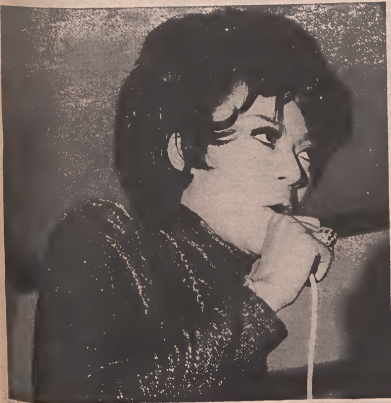
Miss Marlena Shaw in concert.