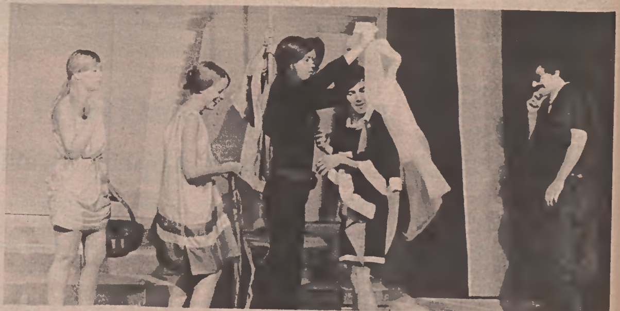
Enthusiasm reigns as these students rehearse for opening night.

Students and faculty of UNCC are invited to attend both performances.