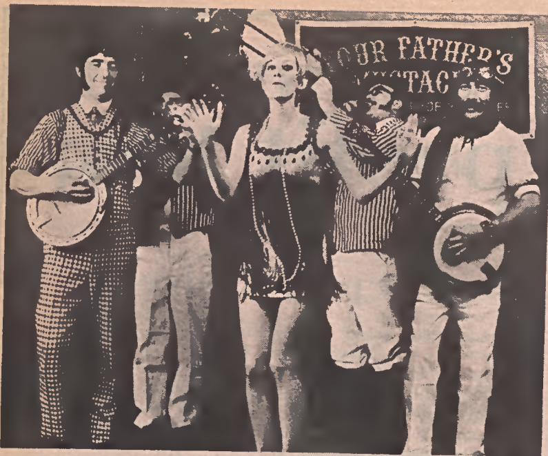
"Ain't she sweet" - in the tradition of the roaring twenties is Your Father's Mustache. See them on campus on November 21.