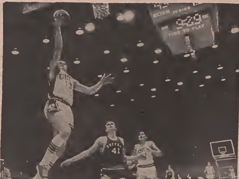
49ers make successful debut in the Charlotte Coliseum Monday night. See related story on page 7.

For further detail, read "Foundations laid for book exchange, on page 4."