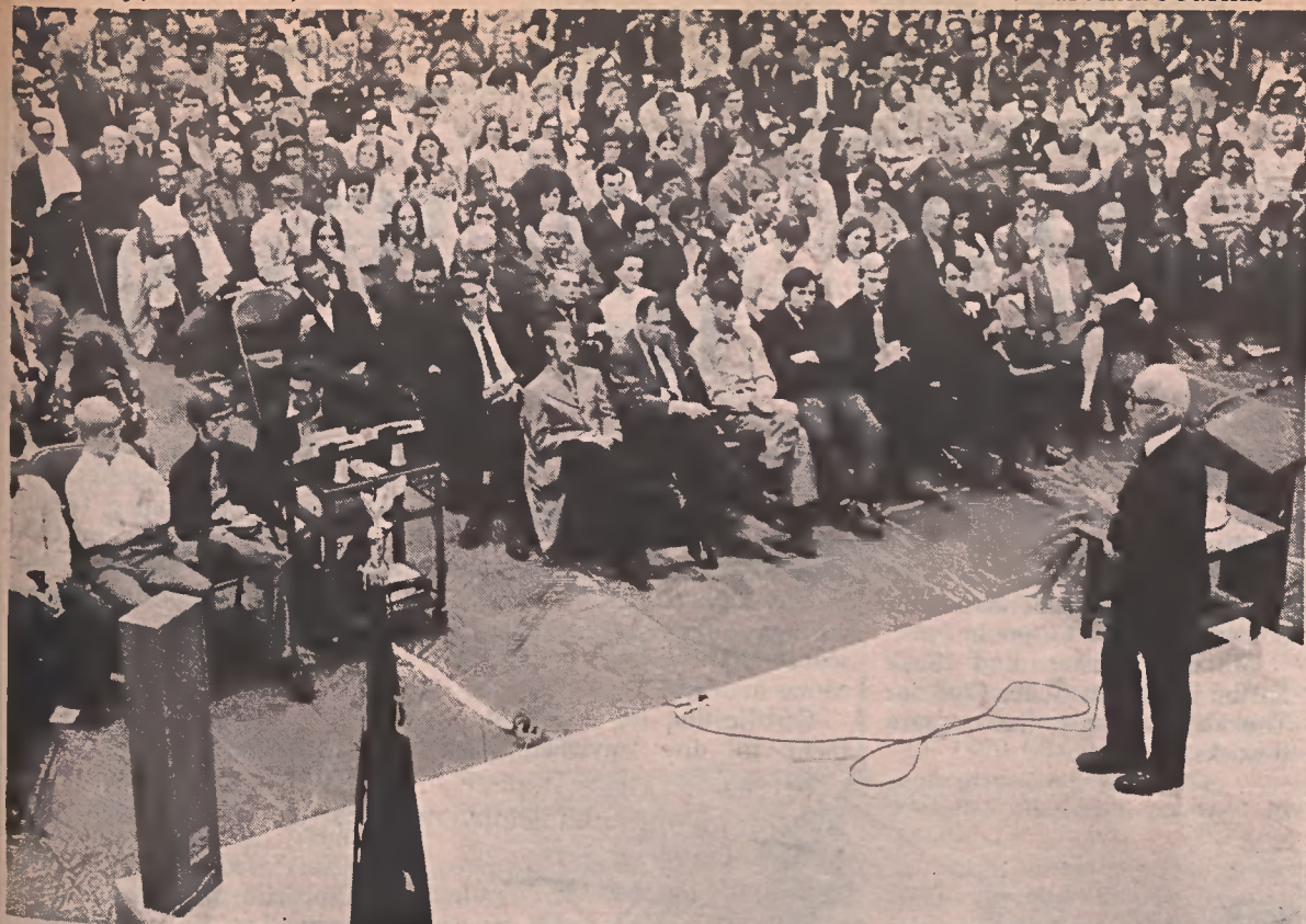
In front of a capacity crowd, "Fuller explained Synergies (one of his favorite terms), and reexplained synergies, and reexplained synergies again." "Everybody listened though, very intensely, even though some did not understand. He's that kind of genius."