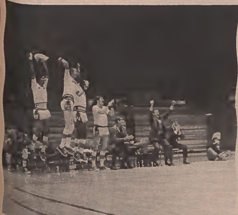
SOMEBODY MUST'VE done something right. The 49ers look elated during one of last year's contests.