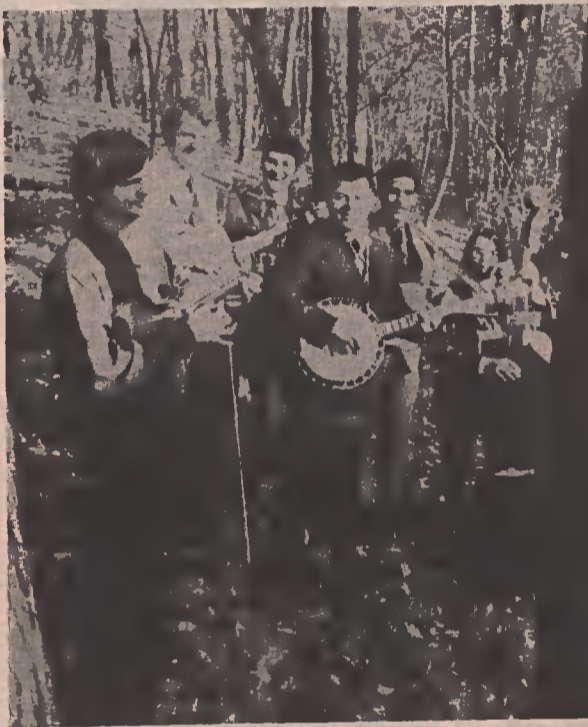
"THE BLUEGRASS EXPERIENCE" .... complete with squaredance caller, fiddlers, foot-stompin' and wine guzzlin' ....at the Dorm Patio, 6 p.m., Friday night....