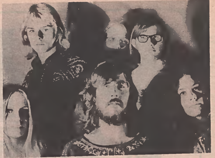
"EROS" ....deliverin' their rock sound for a dance and bash in the University Center Cafeteria, beginning at 8:30 p.m., Friday night. Bring your own whatever....