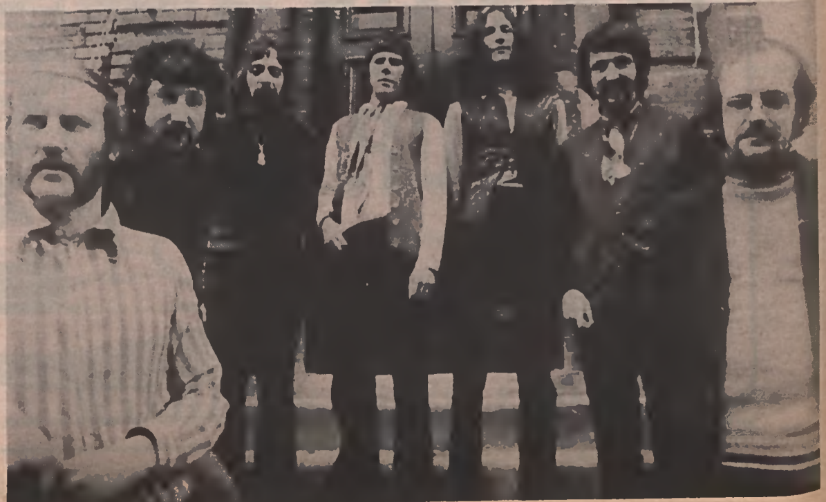
"IF" .... a European brass group, a la Chicago, will rip open the amphitheatre sky at 9:30 p.m., Saturday night....