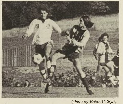
The game against Winthrop was a grand finale for the UNCC soccer team's last home game this season

The action during the remainder of the half was brisk with both teams mounting attacks that were thwarted by fine defensive play or excellent goaltending. Still, the 49er offense was clearly superior to that of the visitors, both in passing and shot selection. The UNCC front line consistently got behind the Eagle defense to take long passes from their teammates. The defensive