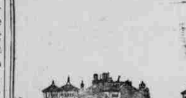
NORTHWEST VIEW FROM THE OHIO BUILDING.