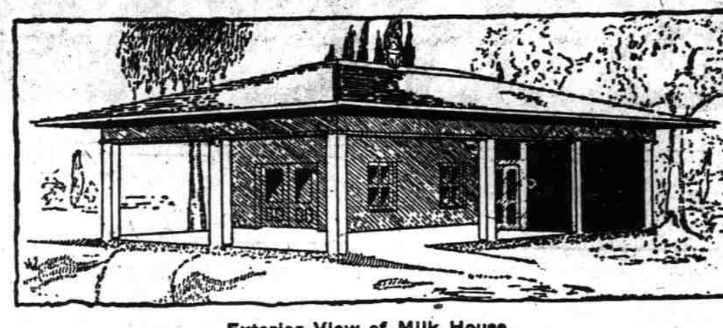
Exterior View of Milk House.

(By J. E. BRIDGMAN.) While it sounds strange, it is true that many farmers who are making the larger portion of their yearly income from milk have no milk house. They have a calf shed, implement house, barn, corn crib, granary, etc., all built for the purpose of caring for and protecting the various products or tools used on the farm, but they have never thought it necessary to build a milk house. Many model housekeepers are compelled to keep milk in unsanitary rooms, such as some outbuilding, the cellar, kitchen, or other general purpose room for the reason that there is no milk house.