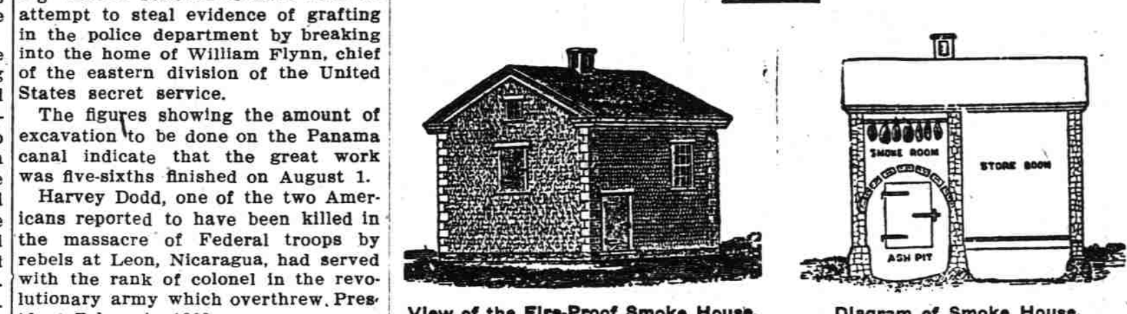
Diagram of Smoke House.

on a ledge or projection from the walls on each side. These pieces of plank have hooks driven in on both edges far enough apart to receive the hams, so that a row may be hung on each side. When full, each is pushed along to one side and another filled, and so on till all are in their places. The ventilators above are then opened, and smoke is started on the heap of ashes below. For this purpose, cobs are used, or unseasoned maple, or body hickory. The smoking should be slow. By the time the smoke has passed up through the opening in the arch, it has become cold, and cannot heat the hams. Ten or twelve days will usually be enough for the completion of the operation, when the ventilators at the end and in the chimney are closed about. The hams being now kept perfectly dark and thoroughly excluded from the air outside, they will keep in good condition; flies will do no injury through the summer with a small fire started once a month, and with the upper ventilator partly open at the time. This obviates the common and troublesome task of encasing the hams in muslin, whitewashing them, or packing them in oats or ashes.