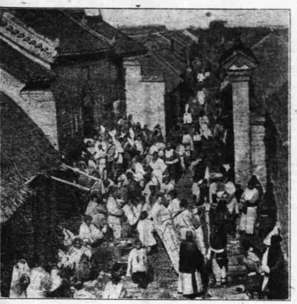
DISPENSING RICE AT SOUCHON, AS SEEN FROM CITY WALL,