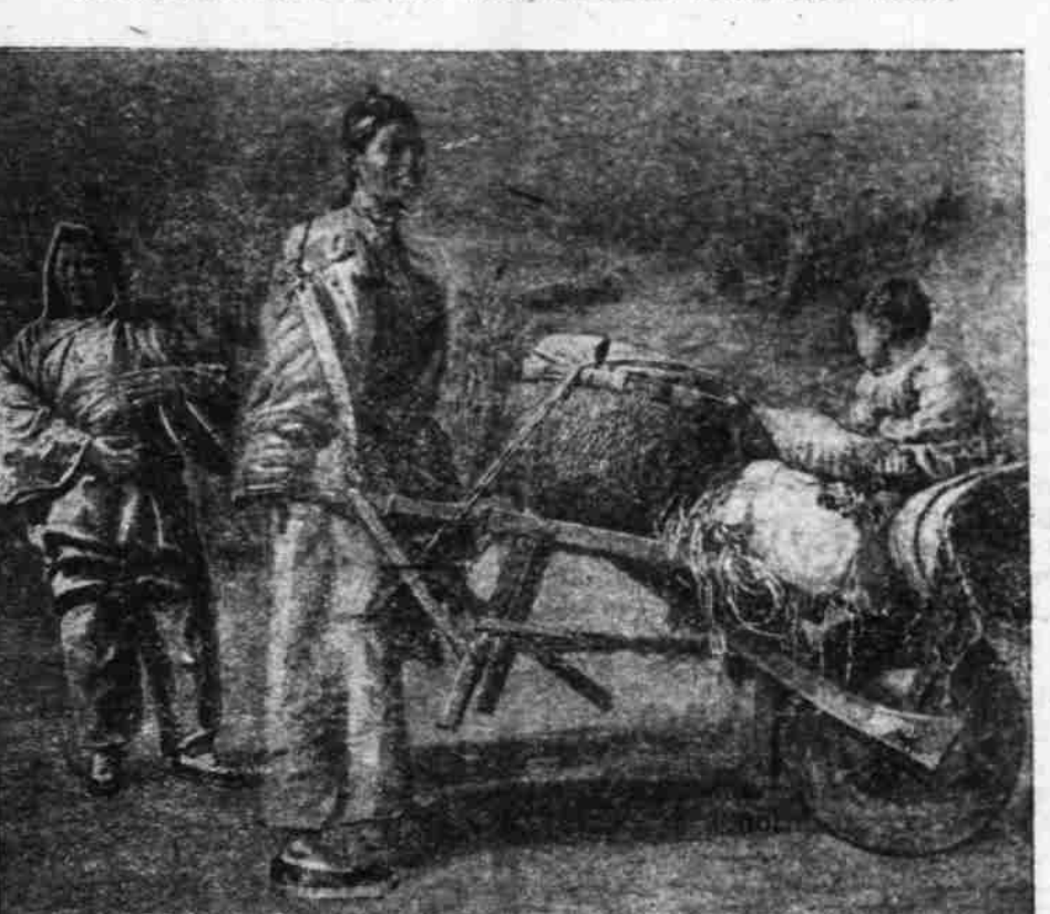
ON THE WAY TO A FAMINE CAMP.