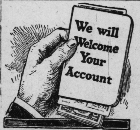
Cabarrus Savings BANK

N. C. State College of Agriculture and Engineering SUMMER SESSION JUNE 12th to JULY 25th Courses for Teachers holding Standard, State Congraduates of Standard High Schools. Courses Credit for graduates of Standard High Schools courses. Catalogue upon application. Numbers limits ply for Reservation at once to