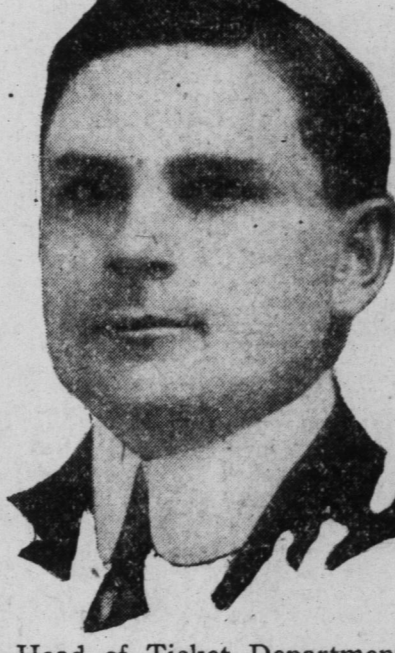
Head of Ticket Department

Industrial Exhibits. Exhibitors who have bought space in the industrial hall as follows: Cabarrus County Cotton Manufactur-