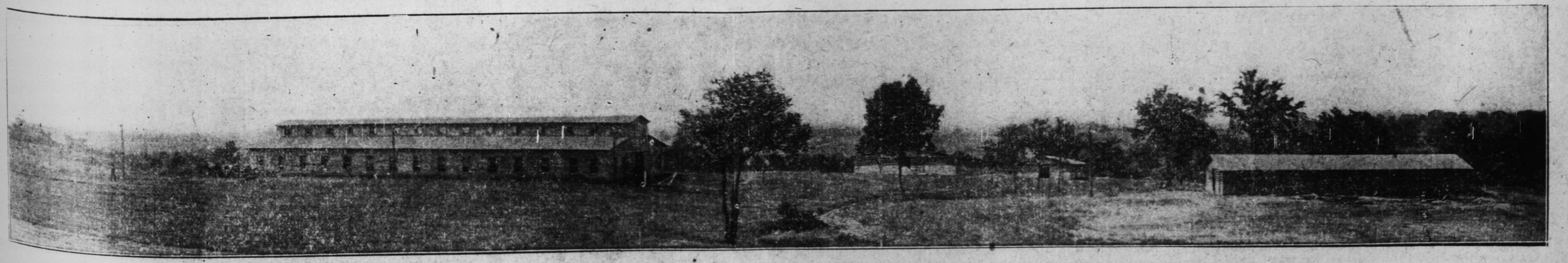
Birdseye View of Cabarrus County Fair Grounds, Showing the Livestock, Poultry, Hog and Exhibit Buildings