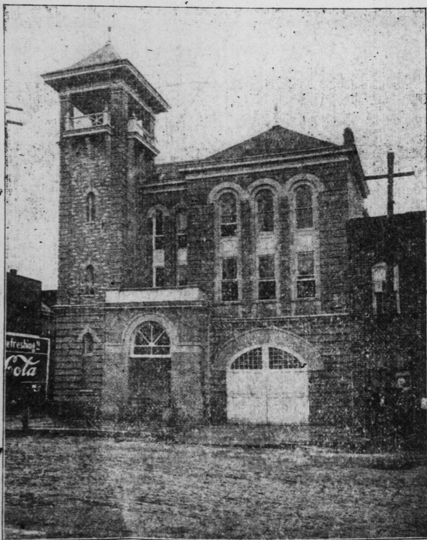
One of Several Buildings Owned by the City

and formerly this officer was known as "Probate Judge" because he had charge of the probate of wills and was the judge to determine all matters pertaining to estates. In addition to these official duties, the Clerk of Superior Court keeps the records and minutes of the Superior Courts held in the county by the Judges of the Superior Court of North Carolina, each of whom presides six months of each year over Cabarrus Superior Court. The Clerk of the Superior Court is paid by fees fixed by law.