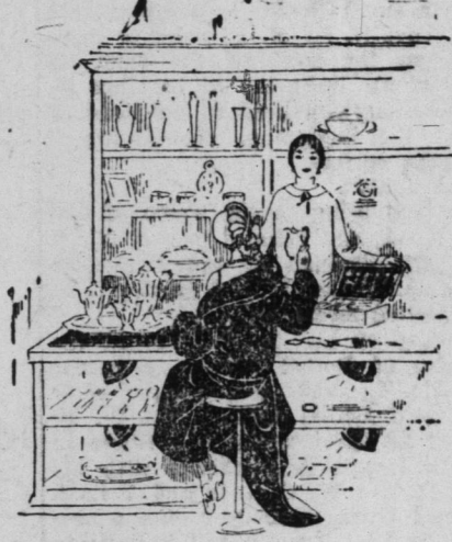
The silverware department holds many a delightful sight for the woman who entertains. Nothing contributes so much to the brilliance of a dinner party as the silver itself.