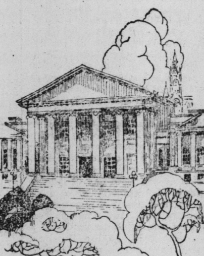
The State Capitol, designed by Thomas Jefferson, is said to be a perfect example of Greek architecture. It is one of the interesting sights of Richmond—five minutes' walk from Miller & Rhoads Store.