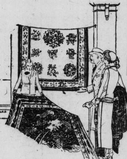
Every sort of floor covering is found in our carpet and rug department—from practical linoleums and grass rugs to the finest, softest and most exquisitely-colored Oriental rugs.