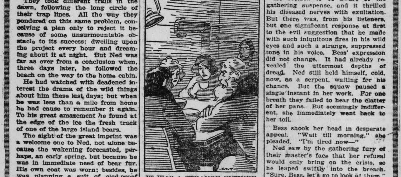
IT WAS A STRANGE PICTURE.

THE ISLE OF RETRIBUTION BY EDISON MARSHALL. Bess Gilbert, Ned Corbet and the latter's fiancée, Lenore Hardenworth, are shipwrecked. They take refuge on an island occupied by a brute named Domsdorf and his Indian wife. The master of the island takes Ned and the two girls prisoners and informs them that he means to make them slaves for him.