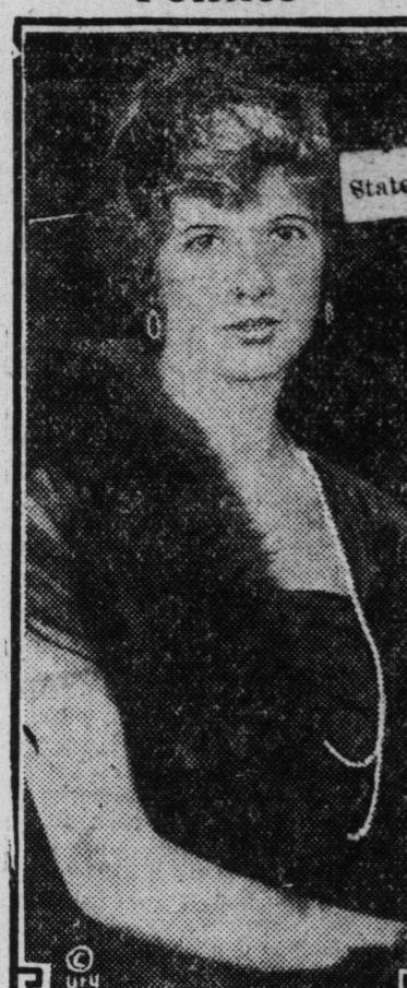
Mrs. Vincent Astor (above) of New York surprised social and political circles by allowing her name to be used as candidate for alternate delegate to National Republican Convention to be held in Cleveland, from 26th Congressional District, New York City.