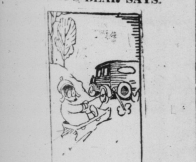
What sat's bear says.