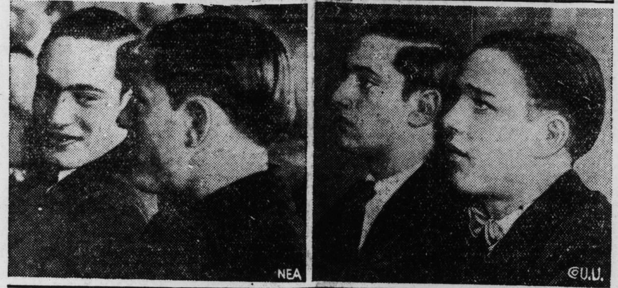
The smile has gone from the faces of Richard Leob and Nathan Leopold Jr., slayers of Bobby Franks. Two weeks ago, when the fight to save them from the gallows started, the two youths took the proceedings lightly, they laughed and joshed with each other. Today it is different—the picture at the right shows the serious strained look that envelops the boys' faces. Perhaps they are now experiencing the "thrill" they sought in murder.