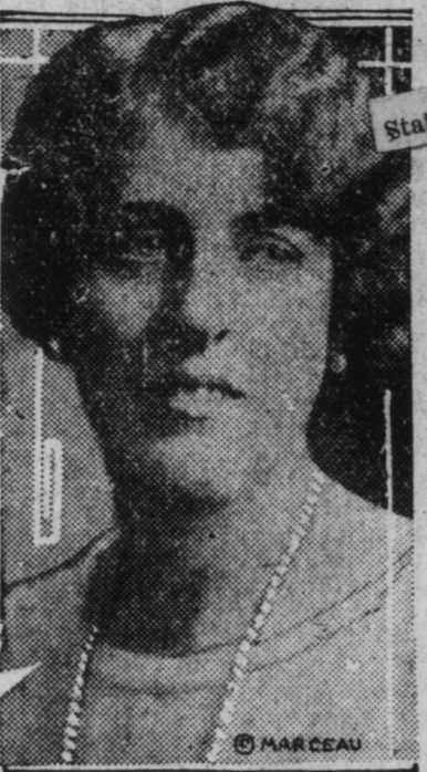
This is the latest portrait of Margaret Wilson, daughter of the late President Woodrow Wilson. She makes her home in Washington.