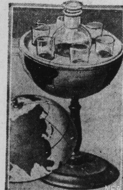
This was a wet "world" until police noticed its peculiar equator. Examination revealed that the northern hemisphere was detachable and that within the globe was an oasis—liquor cache. Theoretically, police say, this cache may be within the Volstead law as all intoxicants in the decanter were below the equator.