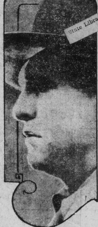
Here's Luis Angel Firpo, once referred to as the "Wild Bull of the Pampas," when he was preparing for his championship bout with Jack Dempsey. He's now a very "tame bull" and is shown as he looks working on a farm in Buenos Aires. He hopes to stage a come-back in the ring next year.