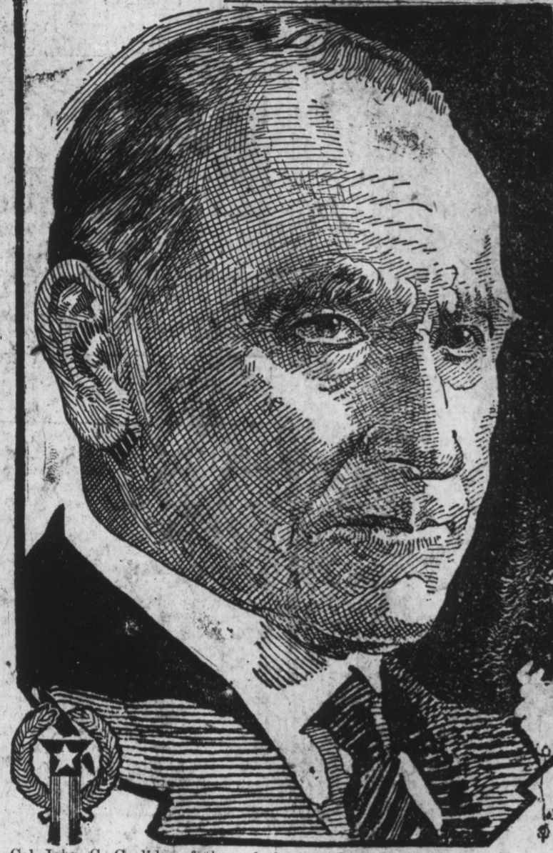
Col John C. Coolidge, father of the president, is dangerously ill, and at this printing the president is said to be starting for his father's bedside.