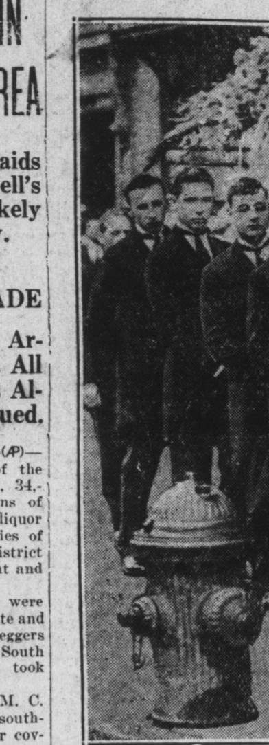
The casket containing the body of Rudolph Valentino was carried into the Grand Central station, New York, on the start of the trip to Hollywood, where it will be buried.