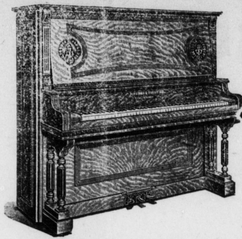
These pianos are very substantially made of the best material, by skilled workmen. They have a full iron plate, nickel plated tuning pins, 1 1/2 inch iron, heavy bearing bar, in first action by clock, double repetition Harvard action, capstan regulative device, graduating pedals including soft, stop or practice pedal, case of cross hatched veneers, extra heavy top and bottom moldings, handsome carved plaques, full top-panel swing desk, exquisite raised carved panels, patent folding fall board, continuous hinges on top lid and fall-board. All GUARANTEED printed in each piano.

It is in fact is complete in every detail, and has a TEN Other dealers charge $350 for the same piano and other pianos of equal grade. How do we do it? We buy them in car load lots, at the lowest possible price, and a small profit satisfies us. We have other pianos as low as $175. And we also carry perhaps the largest stock of organs to be found anywhere in the South, ranging in price from $44 up. Plenty of time given to pay for an instrument if you haven't the cash to spare. Write for catalogue stating whether you want one of pianos or organs.