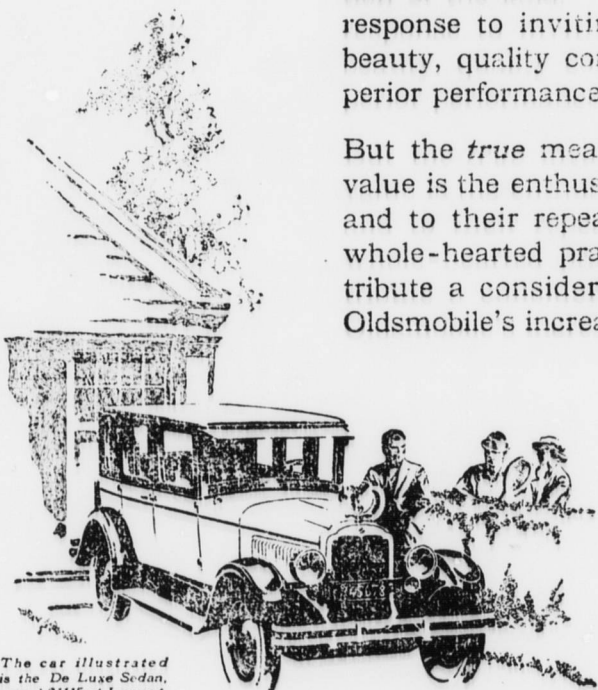
The car illustrated is the De Luxe Sedan, priced $1115 at Lansing.

But the true measure of Oldsmobile value is the enthusiasm of its owners, and to their repeated expressions of whole-hearted praise we frankly attribute a considerable proportion of Oldsmobile's increasing sales.