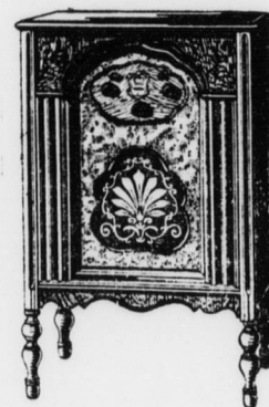
Latest Model Atwater-Kent Cabinet Type RADIO