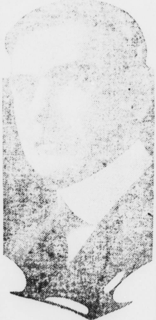
E. V. McCollum

As a first step, however, in the improvement of children's diet, the dining room wars must cease. They are quite as fruitless as any other wars. If a child is properly managed it will eventually acquire the dietary habits and likings normal to adults. It will appreciate the flavors of everything it should eat. And this ideal condition can never be reached through force, but only through tact and diplomacy.