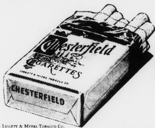
© 1933, LIGGETT & MYERS TOBACCO CO.

Chesterfield ages these tobaccos for 30 months — 2½ years — to make sure that they are milder and taste better.