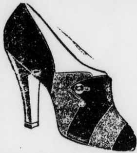
Black Suede and Kid Multi colored