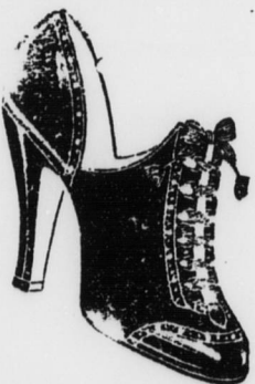
Brown suede and tan calf. Tan Baby Calf. Black suede & black calf. Black Baby Calf.