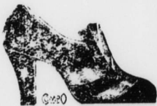
Black suede and Pat. Brown suede and Tan calf. Brown suede & Taupe.