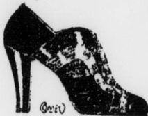
Black suede, Blue suede.