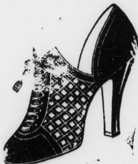
Brown suede and Tan calf.