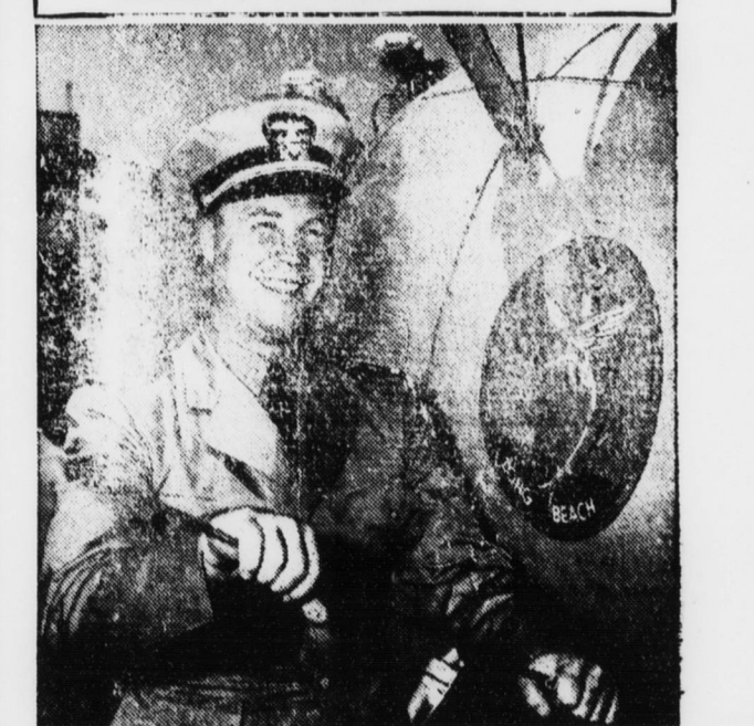
Ensign Wayne Morris Seeks Wings

Wayne Morris, recent star of "I Wanted Wings," became a member of Uncle Sam's Navy in May, 1941, when he was appointed to the rank of Ensign. When asked what he thought of the United States Navy, Morris said, "I think every man who is considering joining a military service should look into the 'chance of a lifetime' which the Navy and Naval Reserve offer to get into the big-pay field of the future—aviation. In the Navy you can attend the finest flight training schools in the world, and receive in-