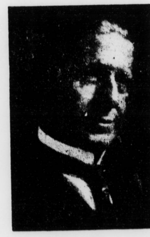
U. S. Senate CLYDE R. HOEY