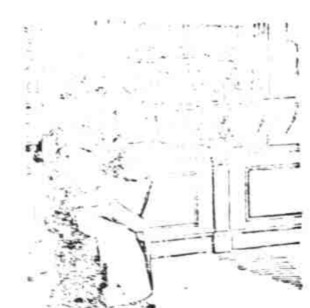
The Jrug Store