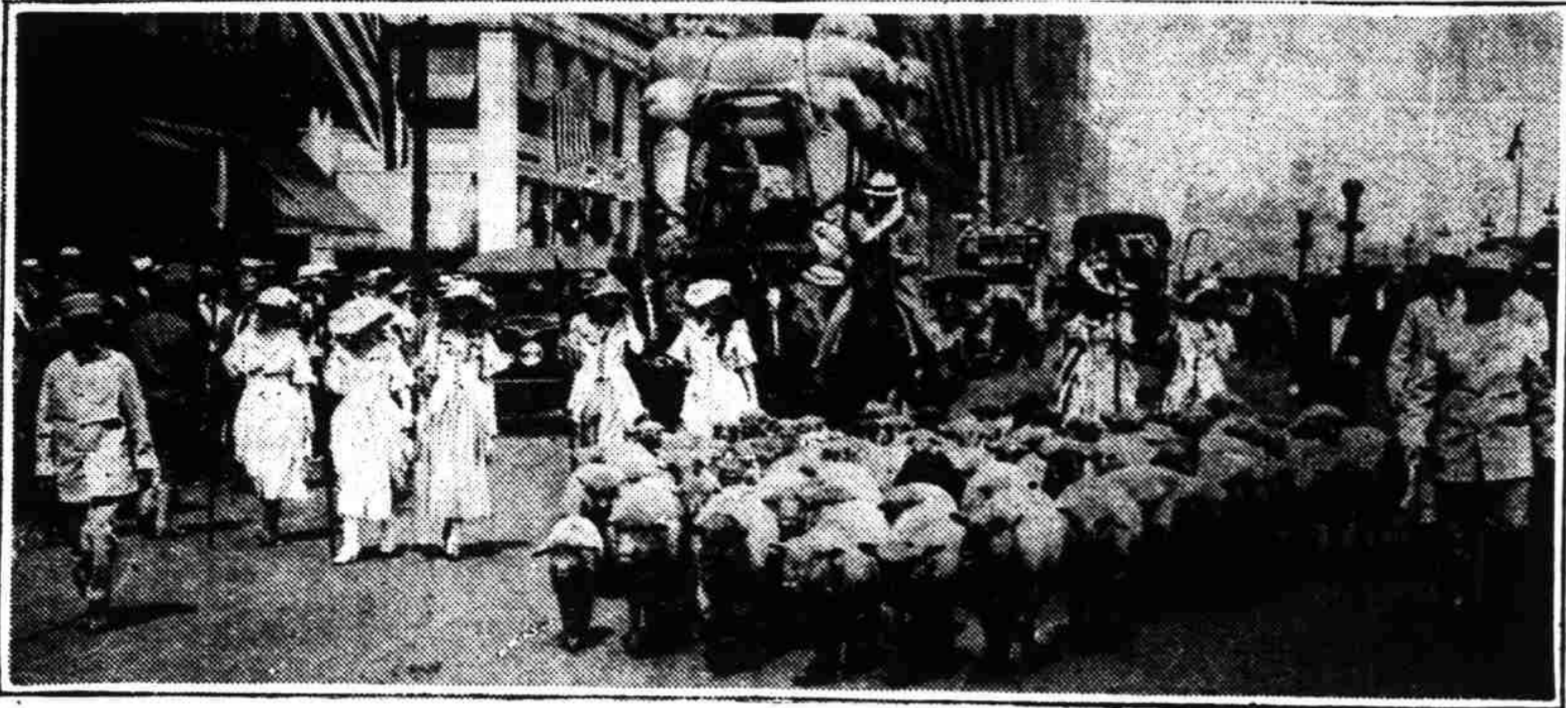
Chicago recently witnessed the enthusiasts of the "wool will win the war" movement parade in the interest of the wool industry, and both little Bo-Peep and all her sheep were on parade.