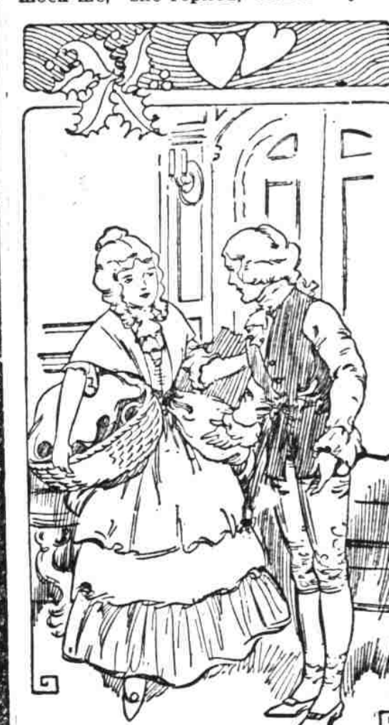
"I Did Not Expect a Vision!"

"And I pray you, monsieur, not to mock me," she replied, with a wry lit-