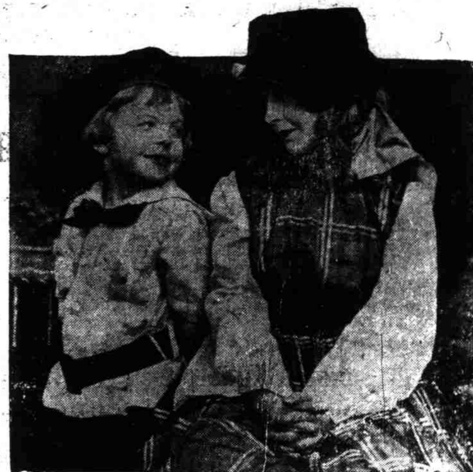
Lillian Gish and Master Ben Alexander in D. W. Griffith's "Hearts of the World" at White's theatre Wednesday, Thursday with daily matinee.

The classes of diseases which cause more sickness and deaths in the State are the diseases spread through the discharge from the bowel and from the mouth and throat. To prevent these diseases, in the simplest expression of facts, it is merely necessary to keep the bowel discharges of A out of the