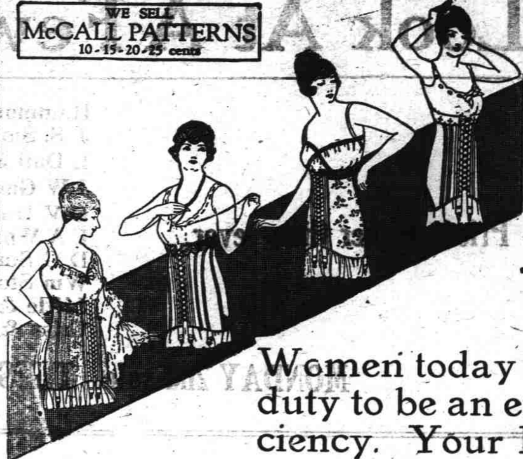
"KABO LIVE MODEL" FRONT LACE AND BACK LACE CORSETS.

WE SELL McCALL PATTERNS 10-15-20-25 cents