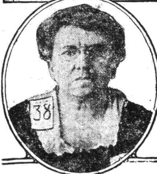
ALEXANDER BERKMAN and EMMA GOLDMAN, Deported by U. S. Department of Justice as Leading Spirits in Communist Plots.